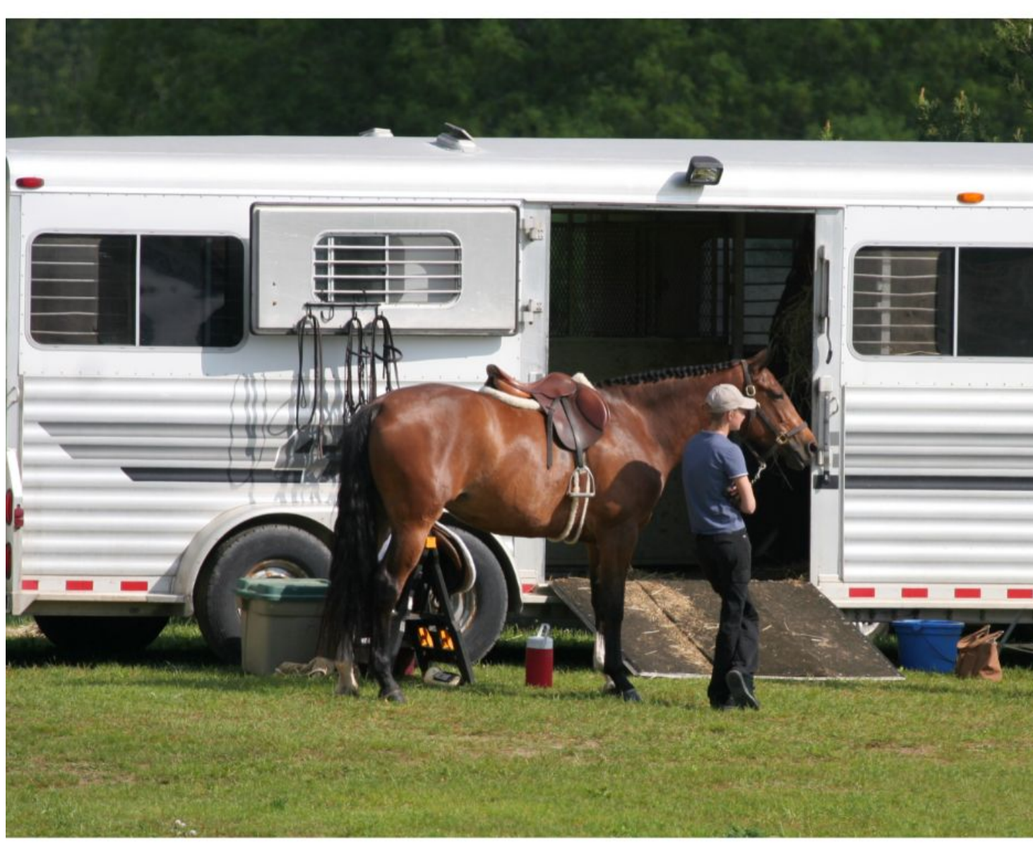
Doing our part to revitalize the local show circuit will be beneficial to riders and horses as well as the surrounding communities.

So, what exactly is the issue and what can we do about it?